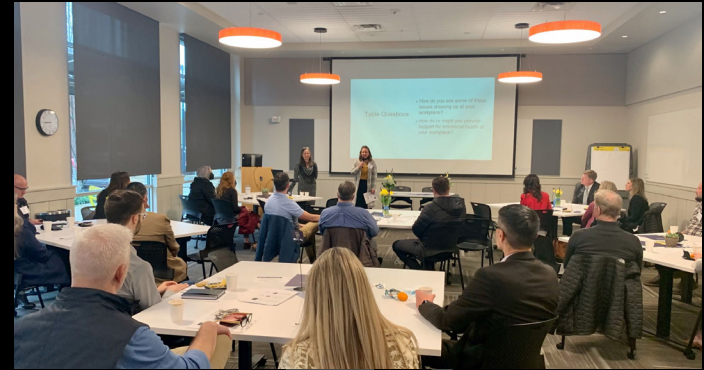
March 9, 2022 Champions of Wellness Event at The Community Room of Northwest Community Credit Union