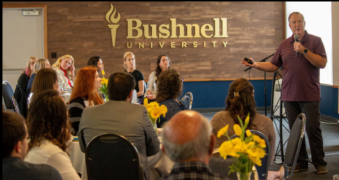
June 10, 2022 Engaging People Event at Bushnell University

The Center for Leadership and Ethics (CLE) hosts events throughout the year to support ethical leadership in Lane County.